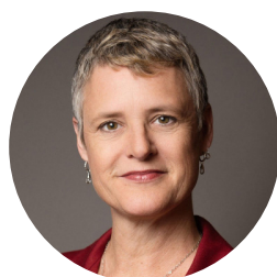
Senator SARAH ECKHARDT STATE OF TEXAS

Workforce Solutions Capital Area is a critical part of the Central Texas employment ecosystem.