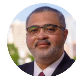
Commissioner JEFF TRAVILLION TRAVIS COUNTY

Workforce Solutions is all about equipping workers with those skills that open doors for the higher-paying jobs.