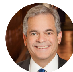
Mayor STEVE ADLER CITY OF AUSTIN

Workforce Solutions' Hire Local Plan and the ideas and strategies that come out of it are so critical to our community.