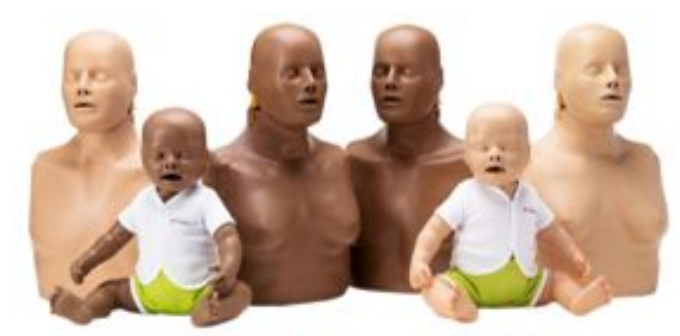
CPR/ First Aid Monthly!